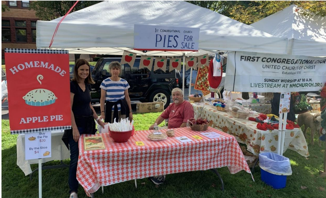
Pie Peeps at the Apple Festival on the Green