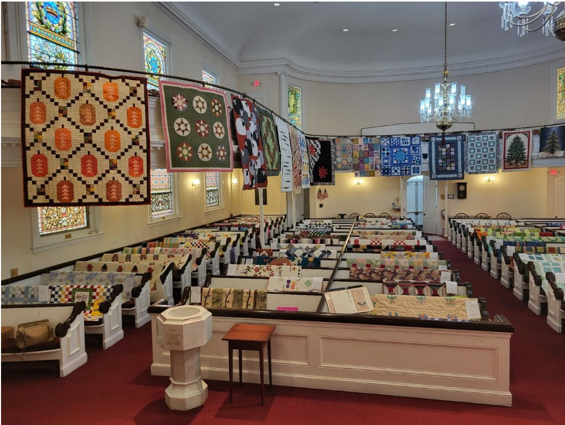
Airing of the Quilts