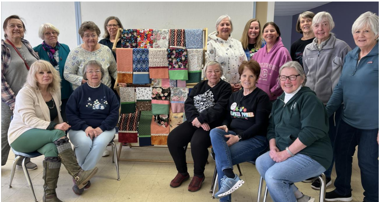
Chapel Quilters sewing project with the Garden Club