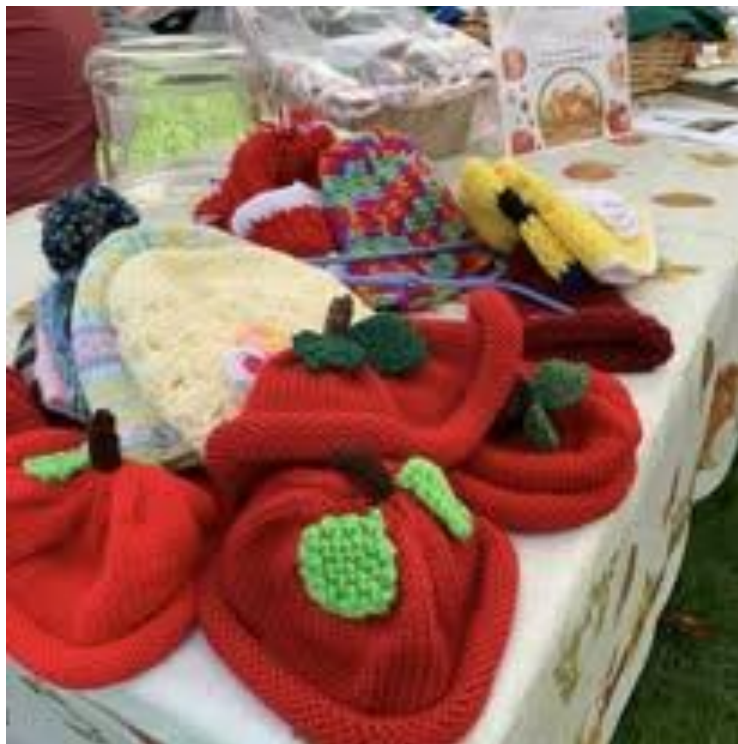
Crocheted items by the Chapel Stitches at the Apple Festival