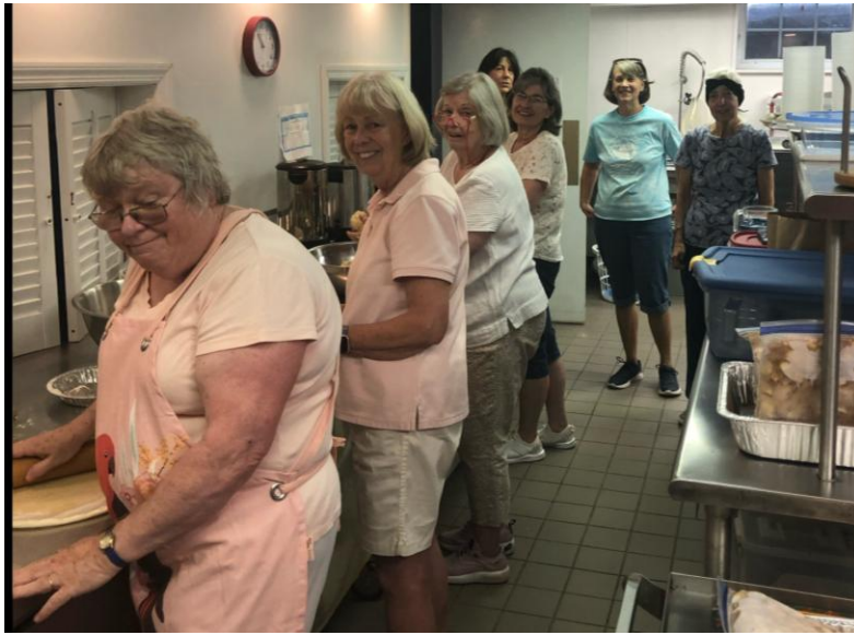
Pie Peeps at work